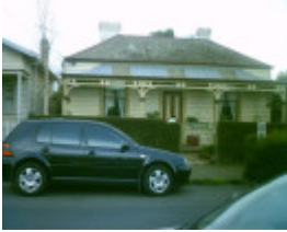
12 Candover Street , Geelong West