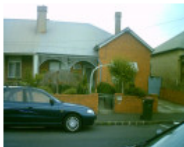
13 Candover Street, Geelong West