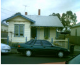
24 Candover Street, Geelong West