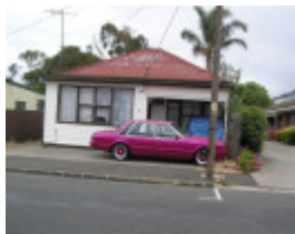
25 Candover Street, Geelong West