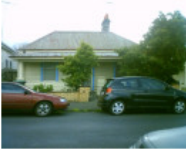
28 Candover Street, Geelong West