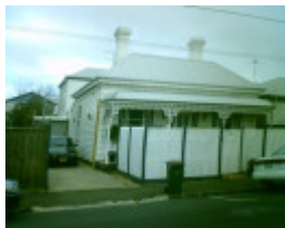
29 Candover Street, Geelong West