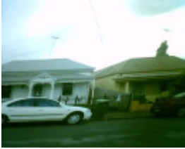
30 Candover Street, Geelong West