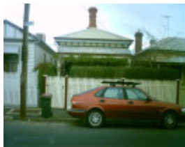
33 Candover Street, Geelong West