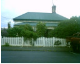
34 Candover Street, Geelong West