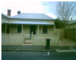
35 Candover Street, Geelong West