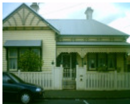
36 Candover Street , Geelong West