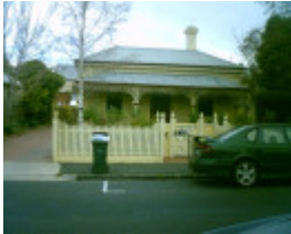
37 Candover Street, Geelong West