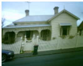
39 Candover Street, Geelong West