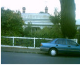
42 Candover Street Geelong West