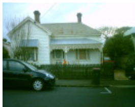
46 Candover Street Geelong West