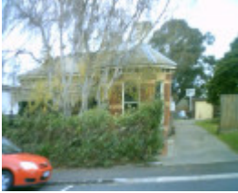
16901 53 Candover Street Geelong West