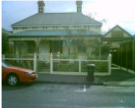
54 Candover Street, Geelong West