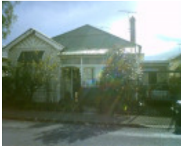
56 Candover Street Geelong West