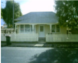
58 Candover Street, Geelong West - 2 Units at Rear