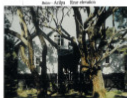
Arilpa - From elevation