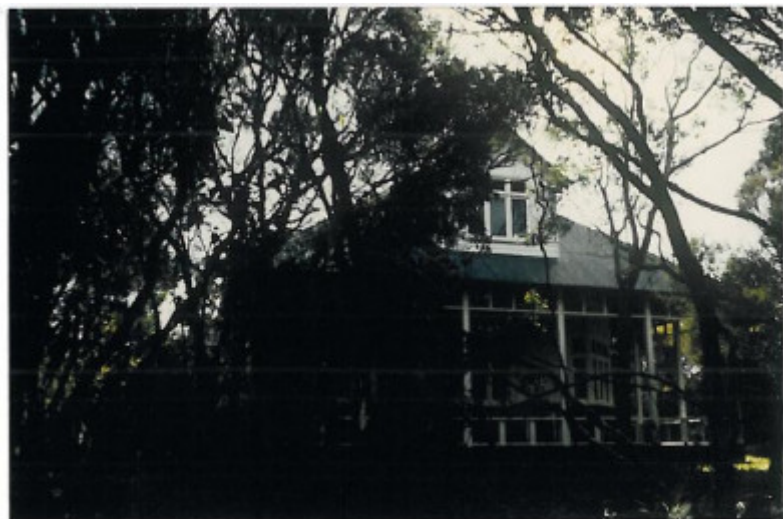
Above - Arilpa Front elevation