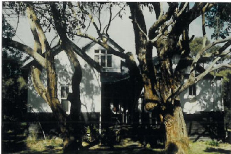
Below - Arilpa Rear elevation