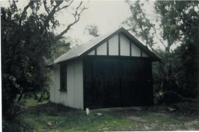
Above - Arilpa Original garage outbuilding