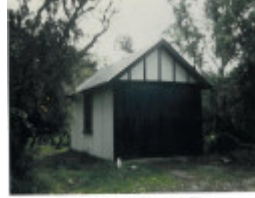
Arilpa - Original prison outbuilding