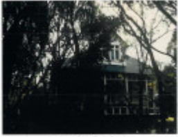
Arilpa - Front elevation