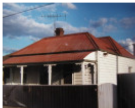
27 Clarence Street, Geelong West