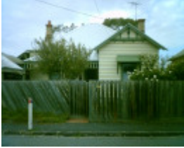
45 Clarence Street, Geelong West