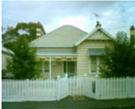
47 Clarence Street, Geelong West