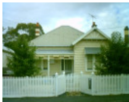
47 Clarence Street, Geelong West