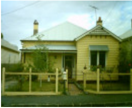
49 Clarence Street, Geelong West