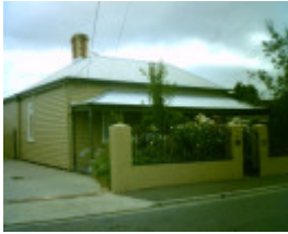
54 Clarence Street, Geelong West