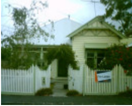
55 Clarence Street, Geelong West