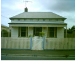
56 Clarence Street, Geelong West