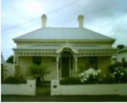
58 Clarence Street, Geelong West