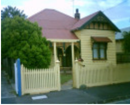
73 Clarence Street, Geelong West