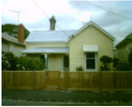
89 Clarence Street, Geelong West