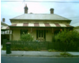
36 Coquette Street, Geelong West