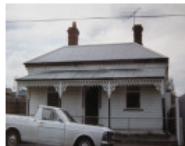
38 Coquette Street, Geelong West