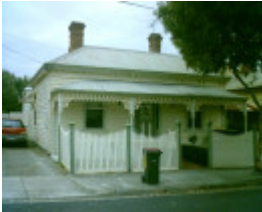
38 Coquette Street, Geelong West