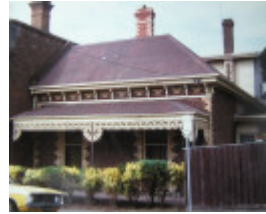
4 Coronation Street, Geelong West