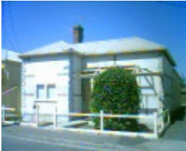
2 Elizabeth Street, Geelong West