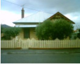
28 Elizabeth Street, Geelong West