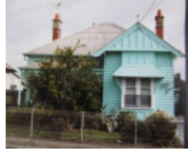
35 Elizabeth Street, Geelong West

Source: Aitken, Honman & Huddle, 'City of Geelong West Urban Conservation Study', 1986.