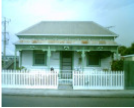
63 Elizabeth Street, Geelong West