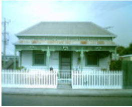
63 Elizabeth Street, Geelong West