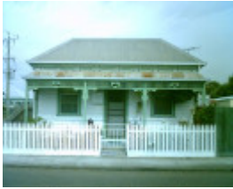
63 Elizabeth Street, Geelong West