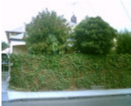
Elizabeth Street, Geelong West