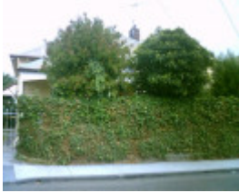
Elizabeth Street, Geelong West