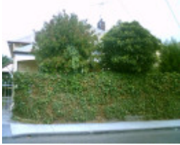
Elizabeth Street, Geelong West