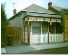
69 Elizabeth Street, Geelong West