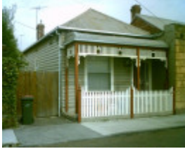
69 Elizabeth Street, Geelong West