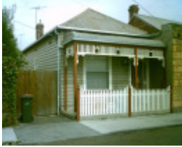
69 Elizabeth Street, Geelong West