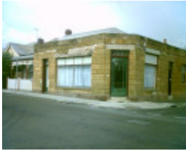
71 Elizabeth Street, Geelong West