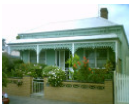
1 Gertrude Street, Geelong West