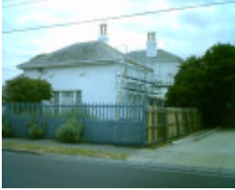
2 Gertrude Street, Geelong West