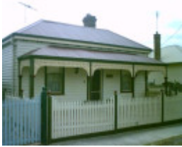
18 Gertrude Street, Geelong West