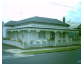
22 Gertrude Street, Geelong West