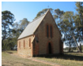
St Peters Carapooee_KJ_29 May 08