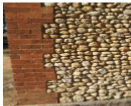
St Peters Carapooee_detail_KJ_29 may 08