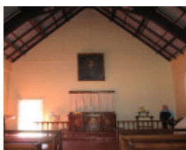
St Peters Carapooee_interior_KJ_29 may 08