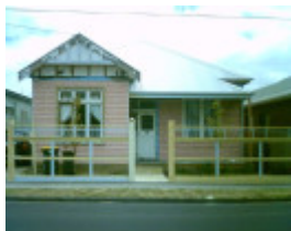
26 Gertrude Street, Geelong West