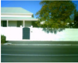
39 Gertrude Street, Geelong West