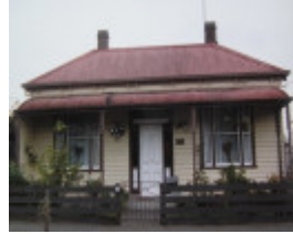
48 Gertrude Street, Geelong West