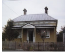
52 Gertrude Street, Geelong West