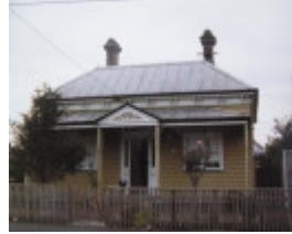
52 Gertrude Street, Geelong West