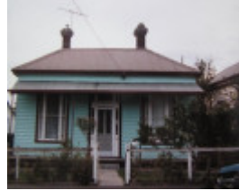
56 Gertrude Street, Geelong West