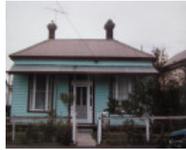
56 Gertrude Street, Geelong West

Source; Aitken, Honman & Huddle, "City of Geelong West Urban Conservation Study, 1986"